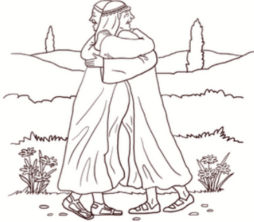
Elizabeth and Mary greet each other.

As Mary and Elizabeth greet each other Elizabeth talks of the blessings that Mary has received.