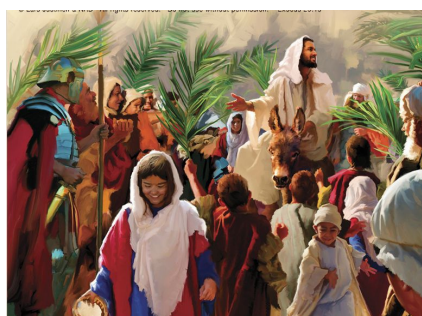
Jesus entering Jerusalem