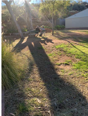
Sitting outside chatting in the sunshine.