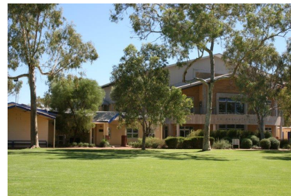
St. Phillips College